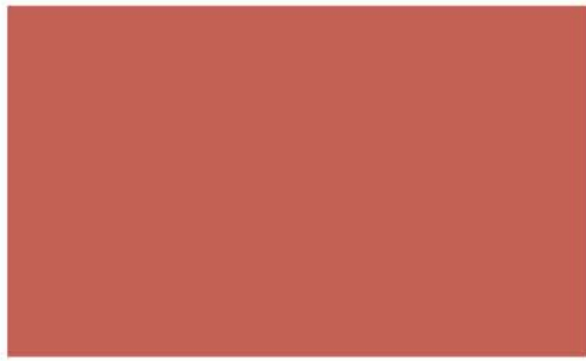
2468-TELHA NOVA PANTONE® 17-1544