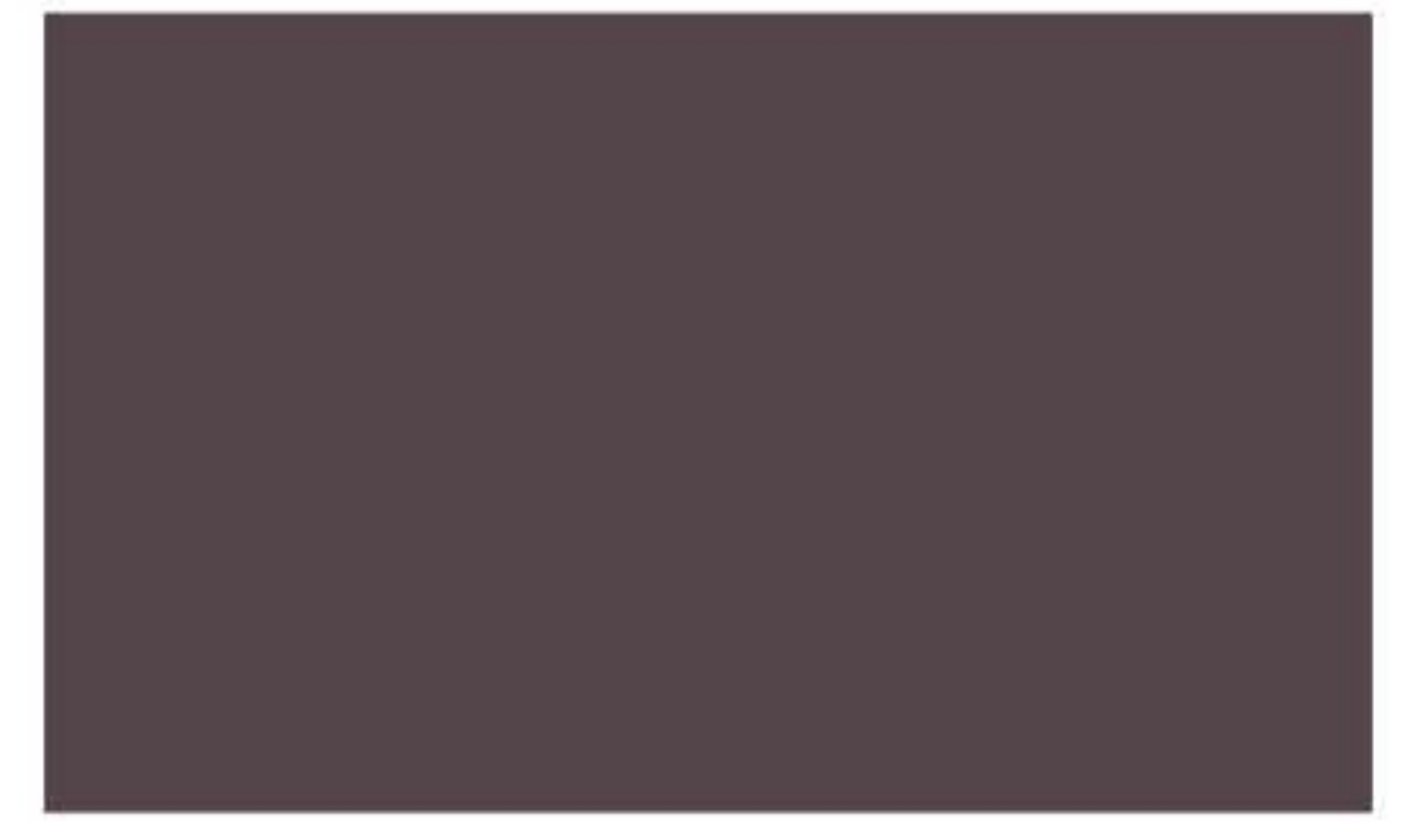
8039-GRAN CAFÉ PANTONE® 19-1619