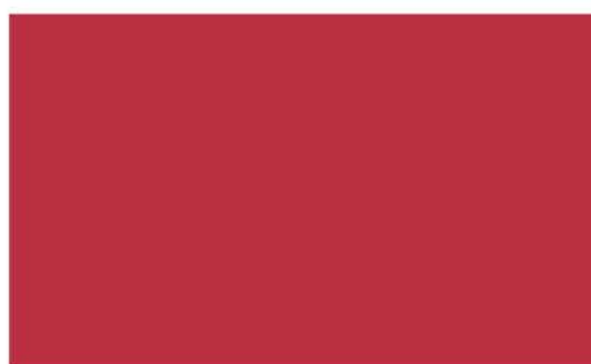
3303-VERMELHO GUEIXA PANTONE® 18-1654