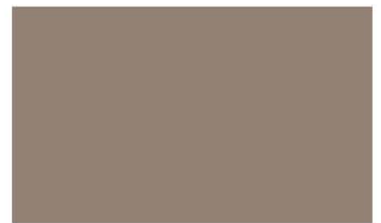
0882-MARROM CAMURÇA PANTONE® 17-0808