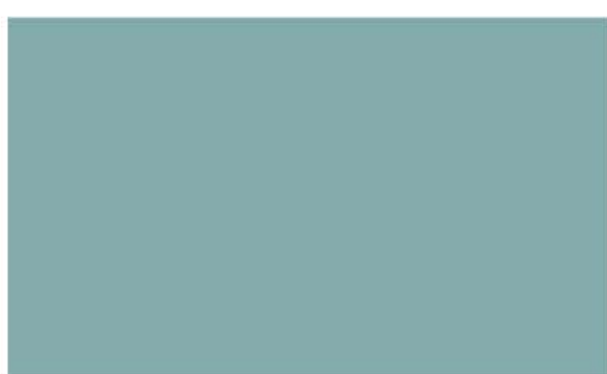
6585-TURKIS PANTONE® 15-5207