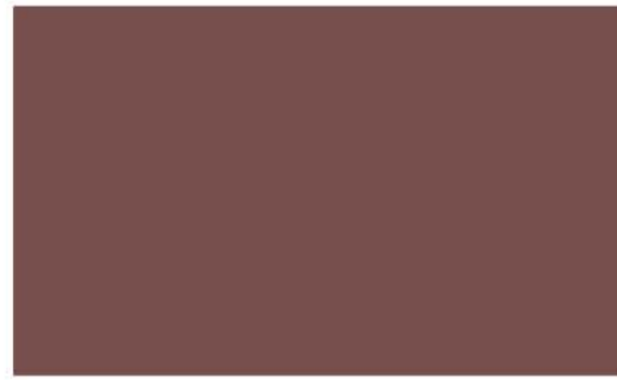
8682-JASPE AFRICANO PANTONE® 19-1320