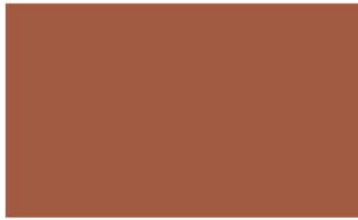
8136-TERRY PANTONE® 18-1250