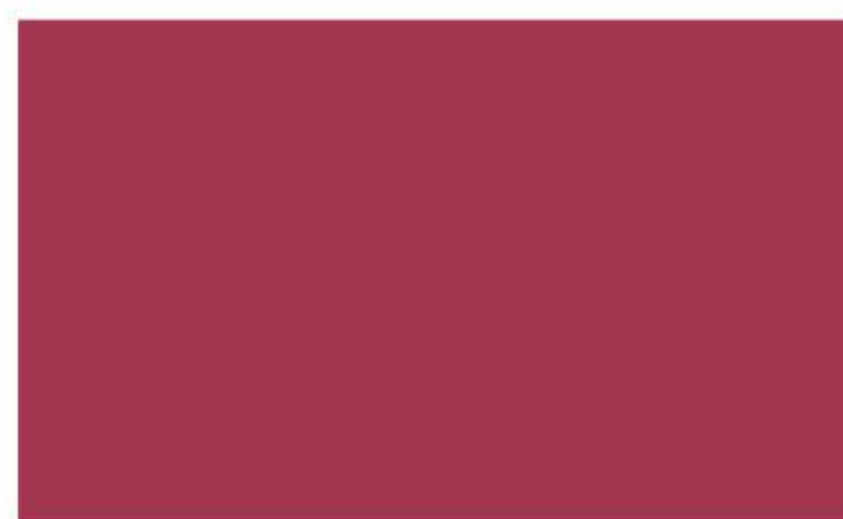
4011-HOLAMBRA PANTONE® 19-1860