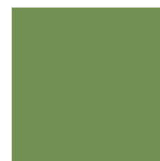
7858-VERDE AZEITE PANTONE® 17-0235