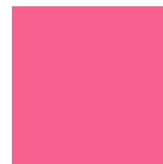
4262-ELKE PANTONE® 17-1937