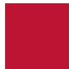
0364-NAOMI PANTONE® 19-1664