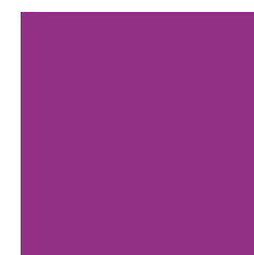
4962-MALVA ROSA PANTONE® 18-2929