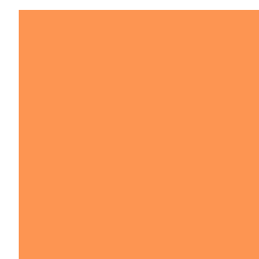
2135-TROPICAIS PANTONE® 15-1247