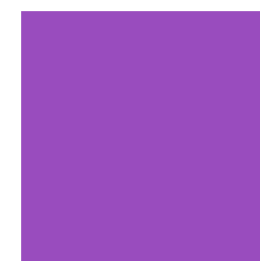
5441-JVA FASHION PANTONE® 18-3533