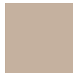
8606-SABHA PANTONE® 15-1309