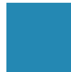
6592-METILO PANTONE® 17-4440