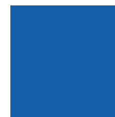
6001-AZUL ROYAL PANTONE® 19-4150